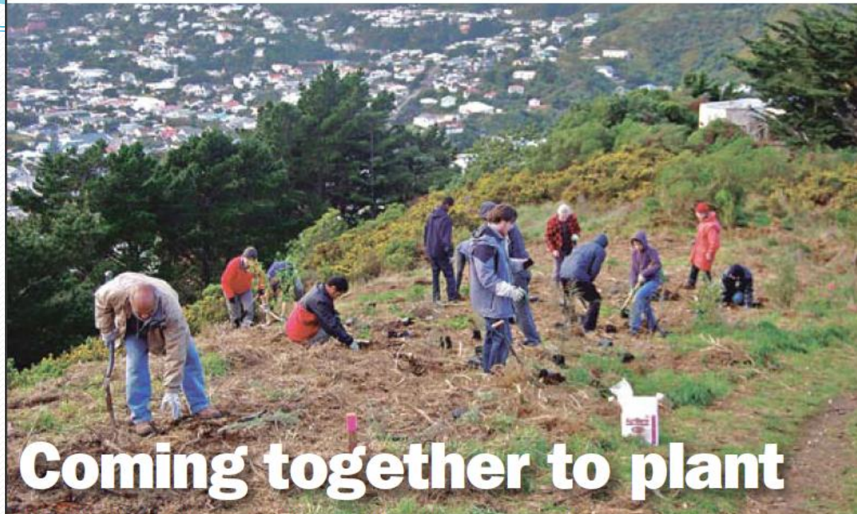
ALL HANDS: Members of the Wellington Interfaith Group and the Island Bay community joined forces in planting out Oku reserve.

R epresentatives of many faiths came together on July 17 as a part of the Wellington Interfaith Group to participate in the Oku Reserve Planting Project.